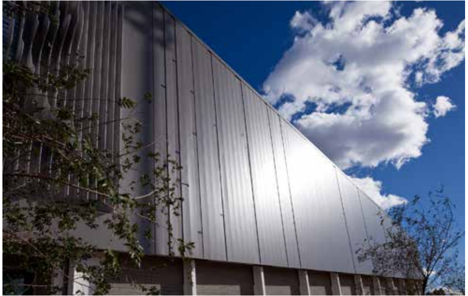
Grand Canyon University, Phoenix, AZ