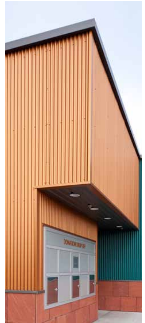
Silicon Valley Animal Center, Milpitas, CA

Additional product information is available from the manufacturer upon request. Metal Sales Manufacturing Corporation product information may be found in McGraw-Hill Sweets, ARCAT.